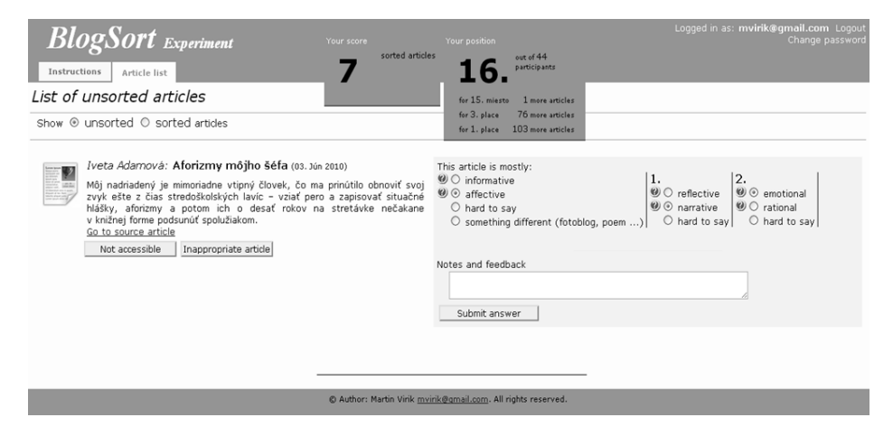
Figure 1. BlogSort web application screenshot. After reading a blog post, a user can decide whether it is informative or affective (bottom-right). The other two columns (for affective dichotomies) appear only after the user selects affective option. To cover the case when the user is uncertain there is always a hard to say option in every column. To filter out non-classifiable posts there is a something different option in the first column. There was also a motivational factor featured in the application: a score based on number of sorted blog articles by a user was visible to him/her. The presented blog content (left) is in Slovak language.

All the blogs were labelled by several human annotators. In line with our motivation to facilitate navigation of web users in blogosphere (e.g., looking up for blog posts that match their preferences), we employed ordinary web users as annotators. Our aim was to provide independent writing style labels from the proposed classification space and assembly a sufficiently large dataset. To meet this goal, we created BlogSort – a web application allowing participants to read the blog post and decide, whether it is informative or affective. In case of affective blog post they were able to classify it into two other dichotomies. We put stress on gathering the most accurate labels. We did not force the participants to classify the blog if they did not want to do so or if they did not know to select the proper class. The participants had to choose the dominant class, otherwise they could choose hard to say option, indicating that it is not possible to decide what the dominant style is. Our aim was to reduce random labels provided by participants at the most and minimize the unwanted noise in the dataset. Figure 1 presents a screenshot of the BlogSort application showing the main user interface.