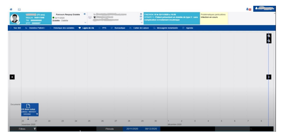
Figure 2. The lifeline visualisation permitting the positioning of added document on a temporal scale

Also, acting as the automatic fallout of the various documents generated by the various health professionals (Figure 4 presents an overview of the page allowing to visualise the different added documents as well as the different actors that may manipulate them) makes Care-O the go-to of the different health care actors looking for further information about the patient. To optimize this automatic fallout of documents, the project proposes the deployment of data modules on the different computers used by the different care actors that act like connectors that bridge the documents from their sources in the EMRs used by the care actors to Care-O.